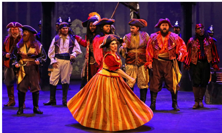
Nashville Opera's PIRATES OF PENZANCE, 2023

An aria is a solo moment for an opera singer and is usually accompanied by the orchestra. Italian for "air" or song, an aria stops the plot momentarily, giving each character the opportunity to express their innermost thoughts and feelings. These pieces also provide an opportunity for the singer to demonstrate their vocal and artistic skill. Arias balance memorable melodies that perfectly suit the human voice while still reflecting the drama of the text.