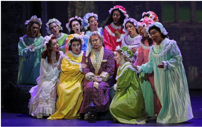
Nashville Opera's PIRATES OF PENZANCE, 2023