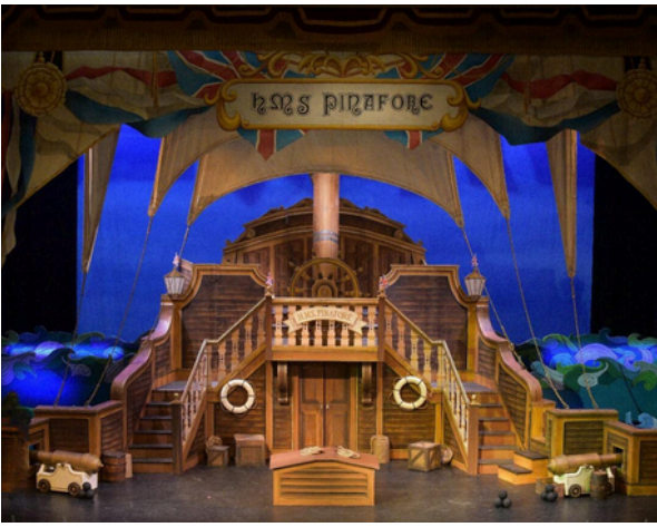
Tri-Cities Opera Company, Inc. H.M.S. Pinafore Props and Set

with librettist, Sir William S. Gilbert, which began with Thespis in 1871. Unfortunately, this operetta was not a success, but they collaborated again in 1875 for Trial by Jury and this operetta was a hit. The duo went on to produce a collection of works, known as the "Savoy Operas," including H.M.S. Pinafore . The duo had many disagreements, but they worked together, with intermittent breaks, until 1896. While Sullivan's most famous works were his collaborations with Gilbert, he had many other works and continued to compose until he died in 1900, leaving behind an unfinished opera.