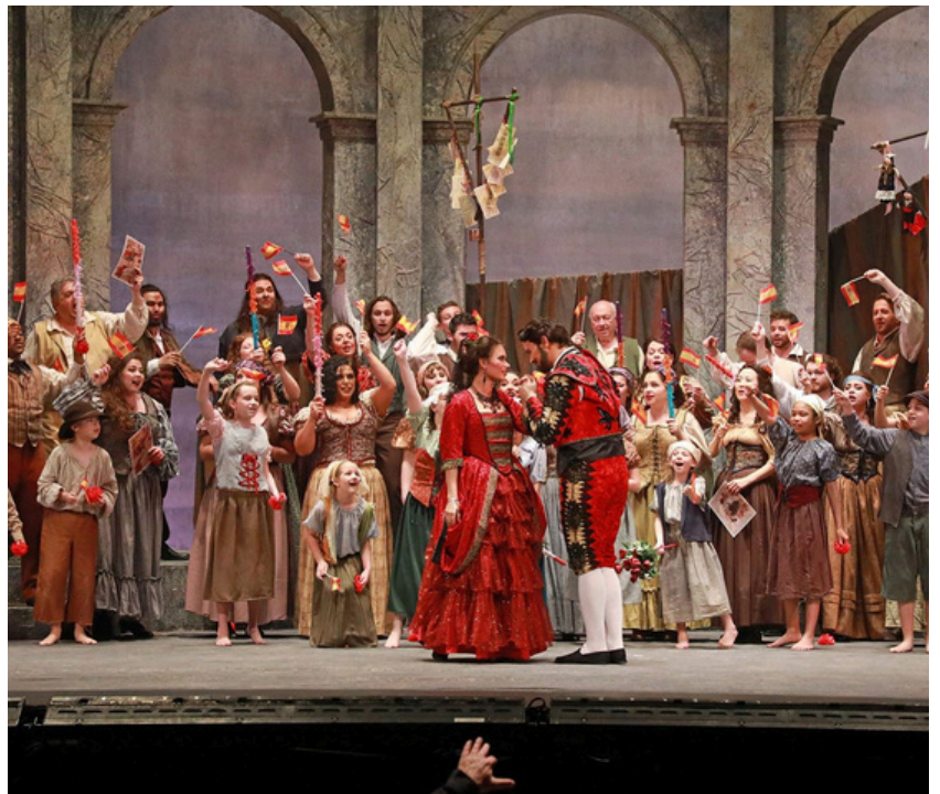
Nashville Opera's 2017 Production of CARMEN

An opera usually begins with an orchestral piece of music called the overture, which functions as an introduction to the opera. Lasting anywhere from five to twenty-five minutes, these opera overtures usually contain important themes from the rest of the production. Before 1800, houselights were not dimmed while the overture played, and audience members continued to talk, drink, and even play cards! This ceased in the 1900's as the overture became a more integral part of an operatic performance. At the end of the overture, the curtain rises, and the story of the opera unfolds through a series of scenes.