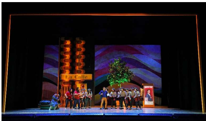
Act 1 - Scene 1